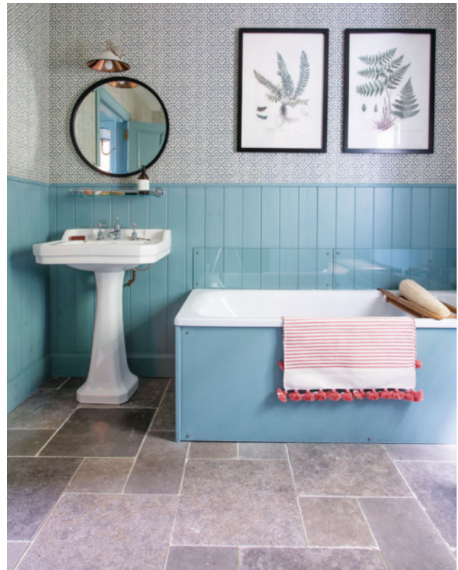
BATHROOM Natural stone flooring and traditional wood panelling and fittings echo the house's rural setting. Sanitaryware, Burlington. Try Quorn Stone for similar flooring. King & McGaw has similar artwork